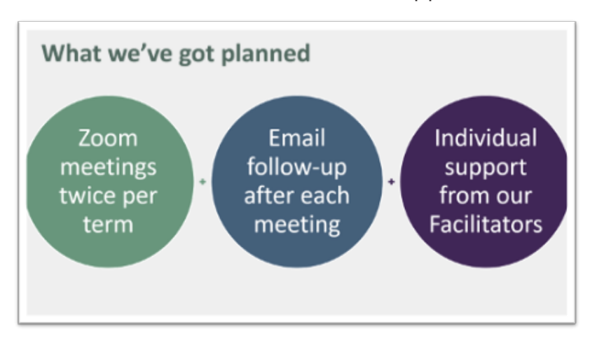
How we connect with this learning community

We have over 100 new school library staff taking part in our learning programme, most of whom started their school library job at the beginning of 2021.