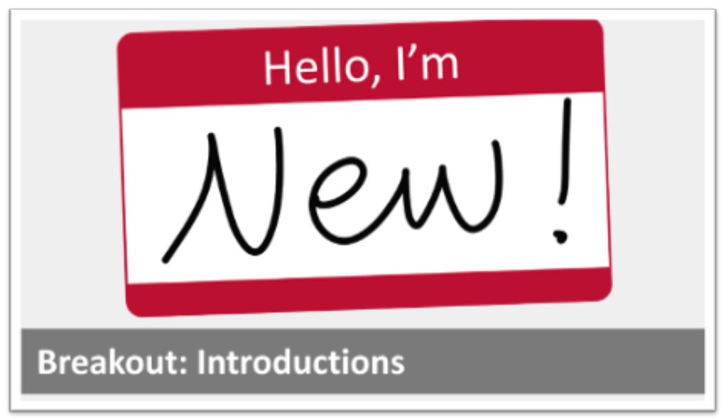
Breakout session from the first Zoom meeting