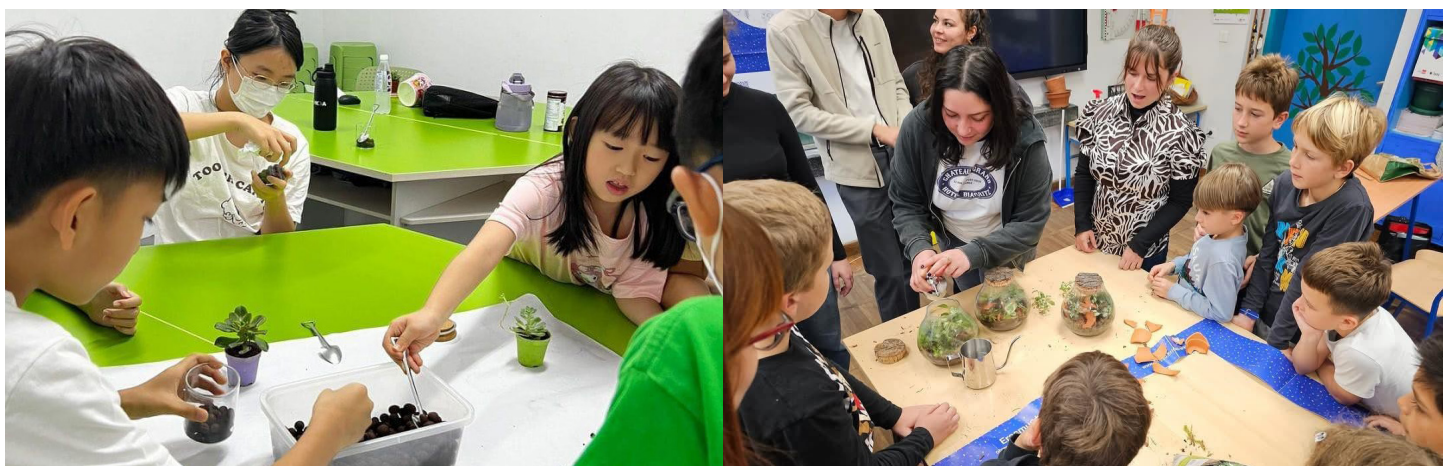
Terrarium workshops in Malaysia and Croatia

Building on this momentum, we have expanded our impact through in-person workshops, providing hands-on training, and fostering deeper collaboration. In June 2024, we held our first face-to-face workshop in Croatia, where the Global Librarians led a week-long session on AI in Education and best practices for transforming school libraries. The event brought together local educators and librarians from neighbouring European countries, fostering meaningful discussions on innovation and sustainability in library spaces. As part of our visit, we also engaged with public libraries, sharing insights and exploring ways to adapt successful school library practices to broader community settings.