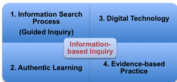
Figure 2: Four Teaching Tools of Information-based Inquiry

Digital information is not pre-selected, leveled, labeled, or packaged.